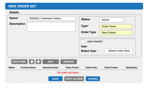
This image is intended for illustrative purposes only.