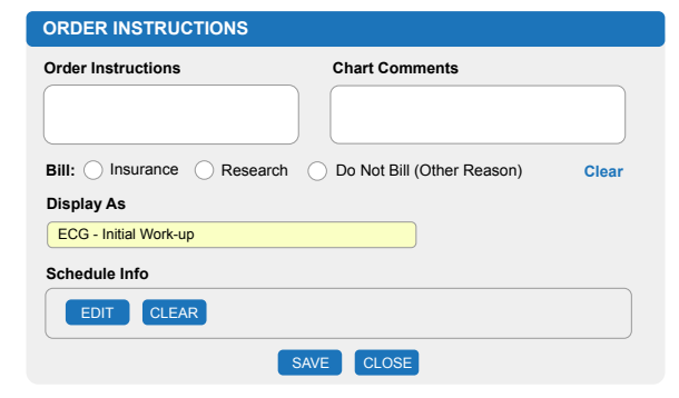
This image is intended for illustrative purposes only.