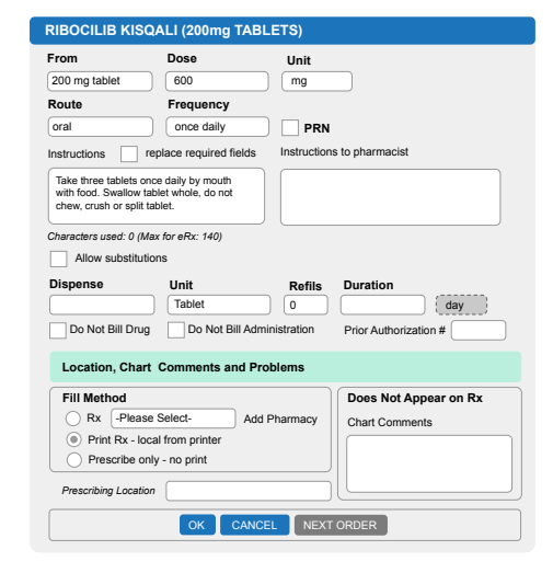
This image is intended for illustrative purposes only.